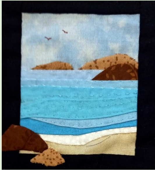
Size 11 cm x 10.3 cm